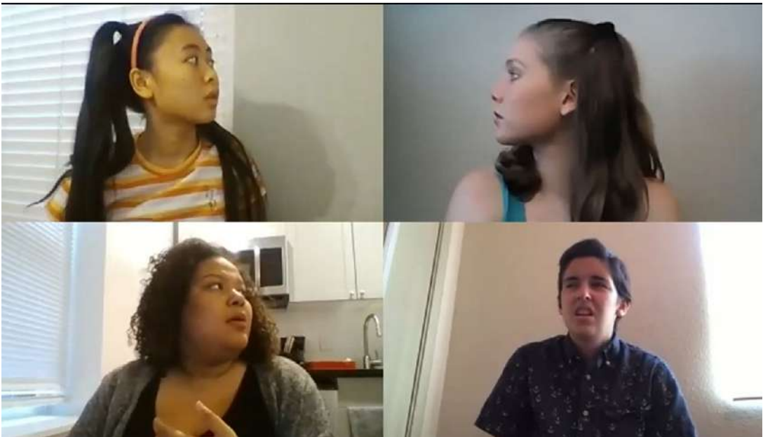
Figure 4. Corona Chicken (Part Two) . The characters' simultaneous response to the sudden break of a news broadcast.

Kirk expresses his pessimistic attitude, saying that they all will die like their brother Bertie. 'If the virus doesn't get us, then . . .' he begins, 59 but his mother interrupts him nervously and orders him to finish his assignment. The tense argument between her and Kirk is comprised of short utterances, interrupted with pauses and shouting. This play mirrors the common familial, social, and psychological troubles resulting from extended quarantine. People undergo terrible nervous pressure, feeling that their life is threatened by imminent danger. Studies suggest that children are more affected by quarantine restrictions during the pandemic because of boredom, restrictions on their social activities, and anxiety about losing a family member. 60 Moreover, 'greater aggressive, anxious, or rebellious behaviours exhibited by children may be results of spending too much time with adults at home and having to change their daily routines'. 61 These negative effects are cleverly portrayed in Grace's and Kirk's interactions and mother-son relationship.