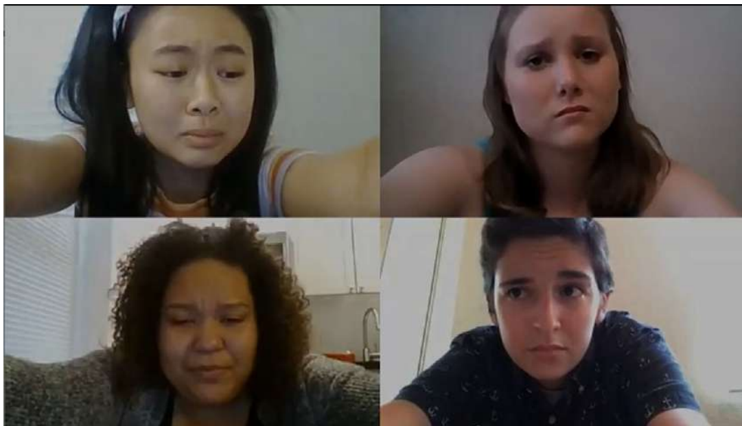
Figure 5. Corona Chicken (Part Two) . The family members stretch out their hands to embrace.

Jami Brandli's Pandemic Therapy (2020) belongs to the same collection, Alone, Together . 64 It reflects the hardships of lockdown and captures our longing for connection. Brandli introduces the play in these words: 'I wanted to explore how a young married couple could have very different reactions to sheltering-in-place for seventy days. I also wanted to add a touch of the absurd with the therapist, the person who is supposed to be the most centered . . . and it becomes clear she is not.' 65