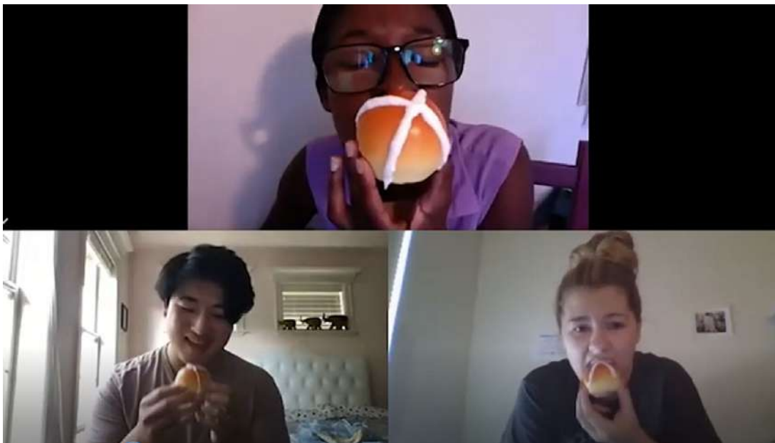
Figure 8. Pandemic Therapy. The three characters share the same food in an act of communal solidarity.

Because of the limits of the Zoom screen, performance allows a limited number of panellists/actors, and the increase of panellists reduces the size of their windows and the